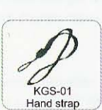
KGS-01 Hand strap