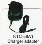
KTC-58A1 Charger adapter

The standard accessories supplied for the radio have a variety of specification options adaptable to different countries and regions.