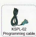
KSPL-02 Programming cable