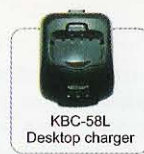
KBC-58L Desktop charger