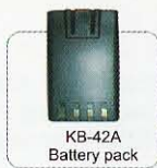
KB-42A Battery pack