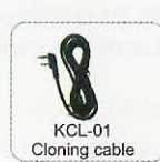
KCL-01 Cloning cable