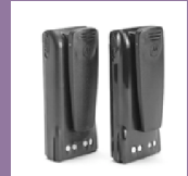
NiMH Battery & Belt Clip