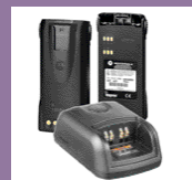
impres™ Smart Energy System