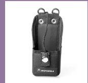
Nylon Carry Case HLN9701